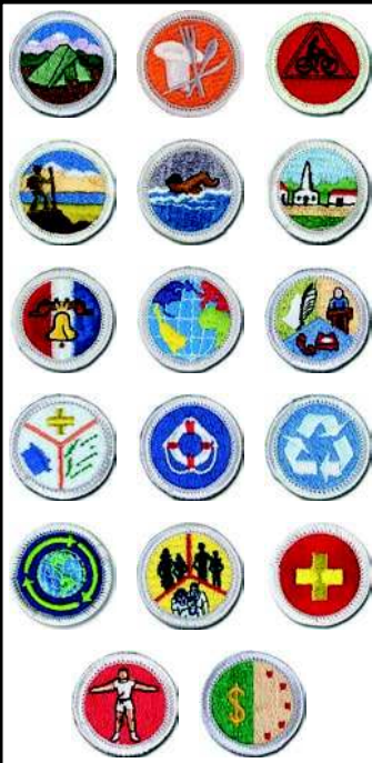
Eagle Required Merit Badges

Learning to Make a Difference Outside the Classroom