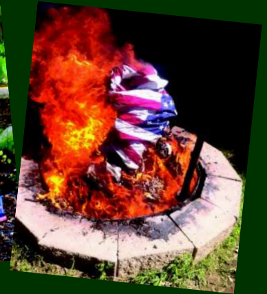
Retiring flags at the Boy Scout Cabin on Barton Lake.