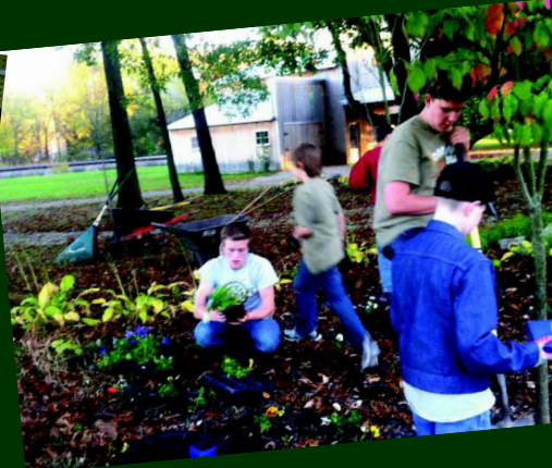
Scouts community service project in the Historic Village helping out with spring weeding, landscaping, and planting.