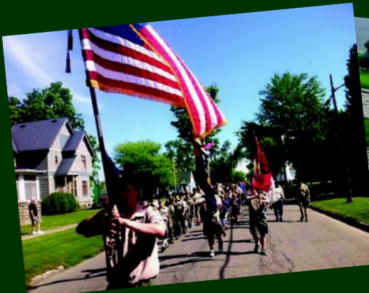
Troop 251 leading the Vicksburg Memorial Day Parade 2014.