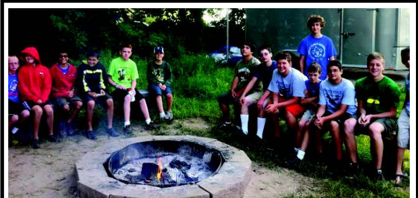
Troop 251 camping out at the Scout Cabin on Barton Lake.