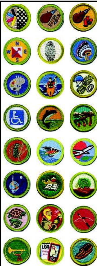
Popular Merit Badges

Merit badges are awards earned by youth members of the Boy Scouts of America based on activities within an area of study by completing a list of periodically updated requirements.